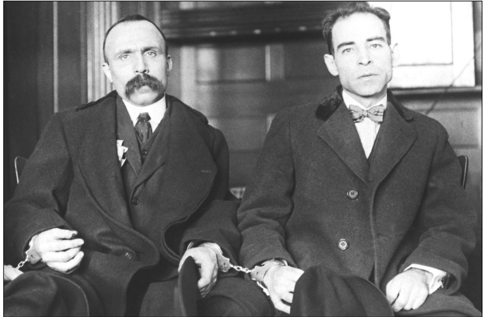
Bartolomeo Vanzetti (with the moustache) and Nicola Sacco were convicted of robbing a shoe factory’s payroll money and killing the two employees carrying the money. Their case garnered international attention in the 1920s.

World War I created tremendous political turmoil. Many leftist groups in Europe and in America opposed the war. They saw it as an imperialist struggle for power and profit, fought at the expense of the working class. But after America entered the war in April 1917, opposition to the war was not tolerated. President Woodrow Wilson made this clear in his Flag Day address on June 14, 1917: “Woe to the man or group of men that seeks to